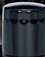
AMSOIL E 3 FILTERS