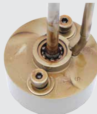
AMSOIL SYNTHETIC MULTI-VISCOSITY HYDRAULIC OIL (ISO 46)