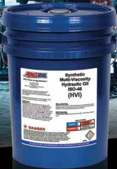
SYNTHETIC HYDRAULIC OIL